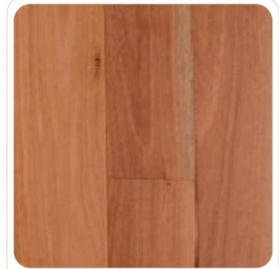
-Nature's Blue Gum-